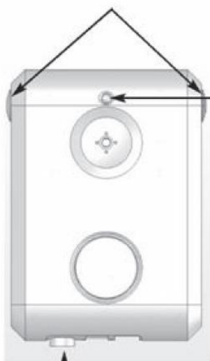
Nurse Call Cord jack

2-Button Reset: Buttons must be pressed simultaneously to reset alarm.